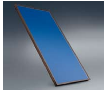
Slim V Collector