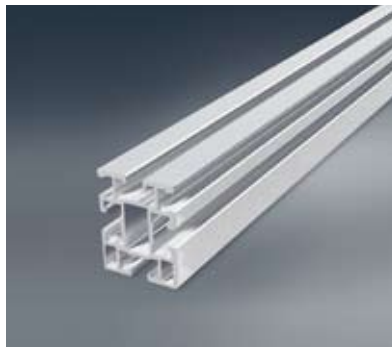
Premium and Slim Line Mounting Kit 2 / 3