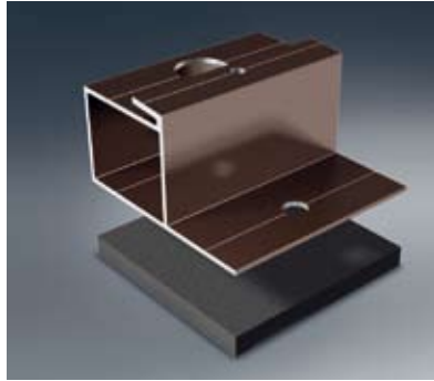
ezFlush Mount Set (only in Slim Line Packages)