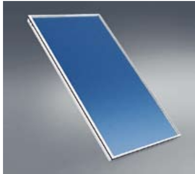
Premium V Collector