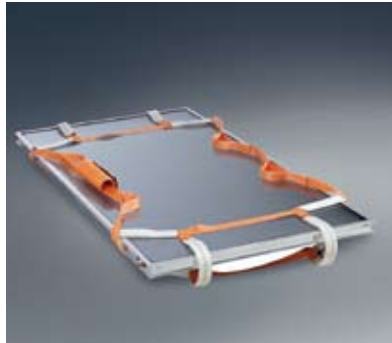
Collector Strap (Only for Slim V Collectors)