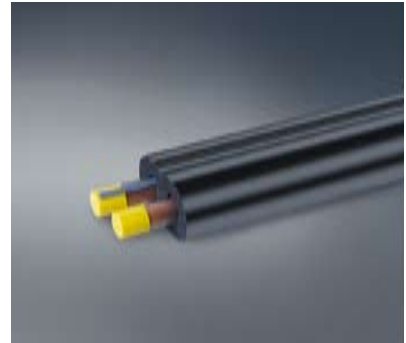
Line Set (optional)