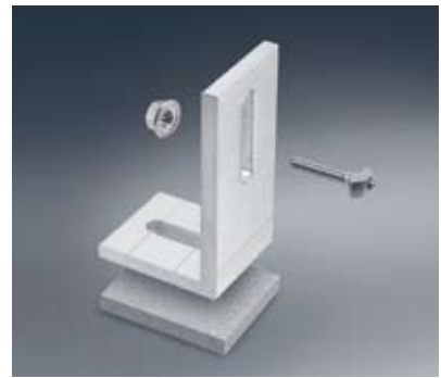
ezL Stand-Off Set (only in Premium Line Packages)