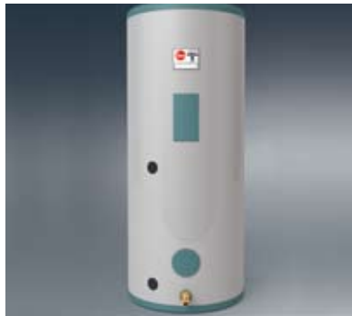
80 / 120 Storage Tank