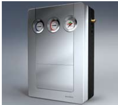
Complete Solar Station