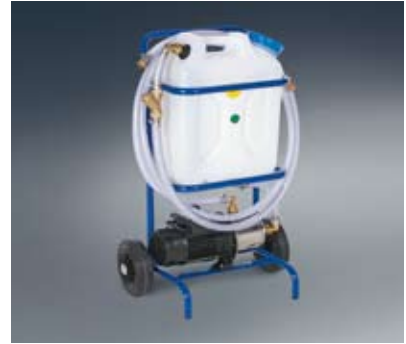
Charging Station (optional)