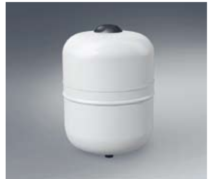
Expansion Tank 4.7 (incl. wall-bracket & flexible pipe)